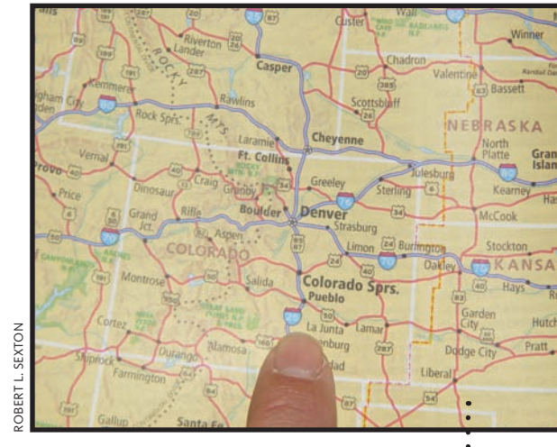
How is economic theory like a map? Much like a road map, economic theory is more useful when it ignores details that are not relevant to the questions that are being investigated.

To determine whether our hypothesis is valid, we must engage in empirical analysis. That is, we must examine the data to see whether our hypothesis fits well with the facts. If the hypothesis is consistent