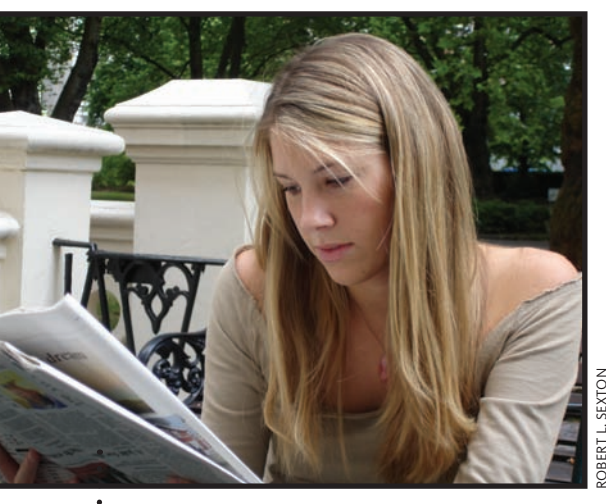
Newspapers and websites are filled with articles related to economics—either directly or indirectly. News headlines may cover topics such as unemployment, deficits, financial markets, health care, Social Security, energy issues, war, global warming, and so on.